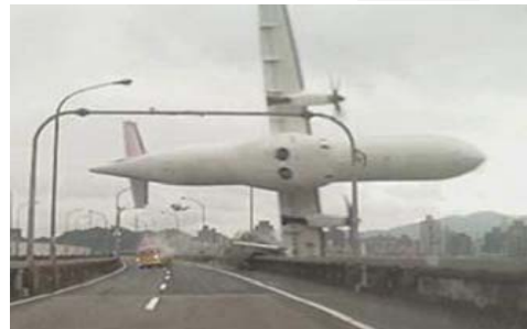
Photo taken by dashboard camera of TransAsia Airways Flight seconds before it crash into the river. Photo uploaded to Wikipedia by user Veggies.

For a free copy of our Root Cause Analysis Template in Microsoft Excel, used to create this page, visit our web site.