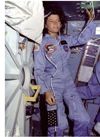
Sally Ride, the first US woman in space and a lifelong advocate for girls and woman in science, died of pancreatic cancer on July 23, 2012.