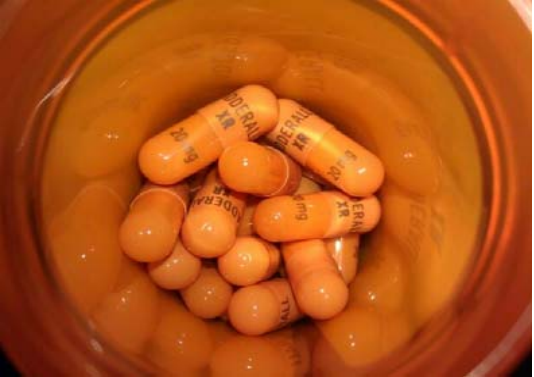
Adderall, a common brand name amphetamine prescribed for attention deficit hyperactivity disorder.